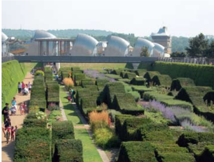
Thames Barrier Park

London Borough of Newham Barrier Point Road, off North Woolwich Road, London E16 2HP. Tel: (0207) 476 3741; www.thamesbarrierpark.org.uk